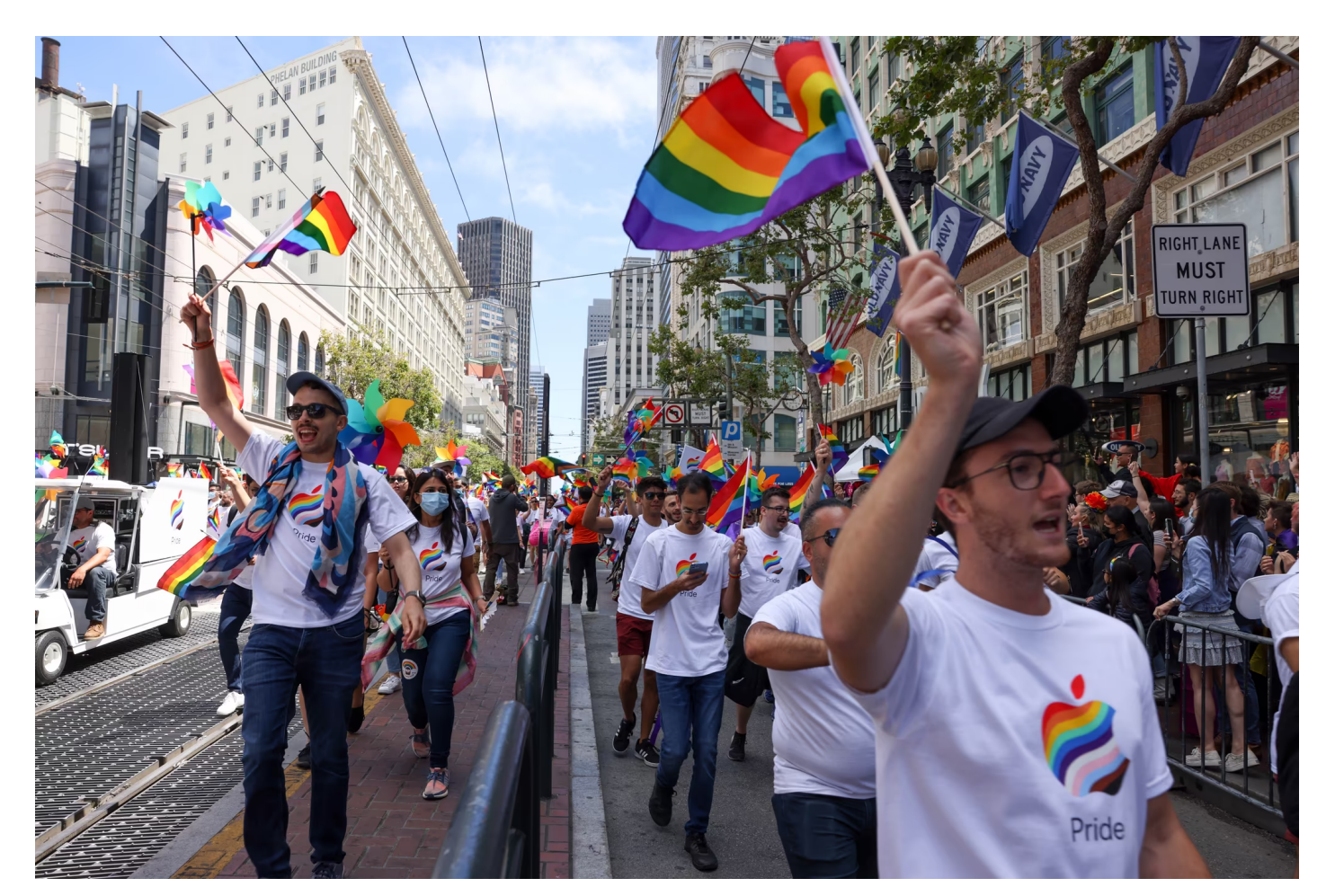
Members of the Apple procession walk in the San Francisco Pride Parade on June 26, 2022.