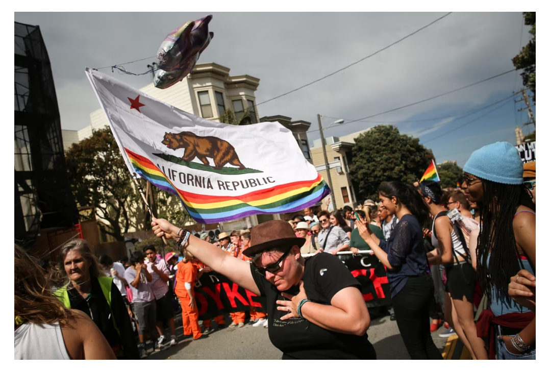
The 2015 San Francisco Dyke March took place days after the Supreme Court enacted marriage equality nationwide.