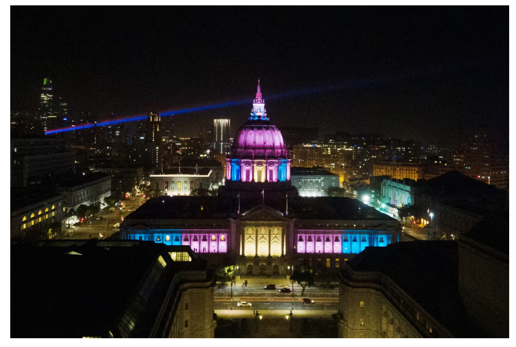
San Francisco City Hall lit up with Trans Pride-colored lights.