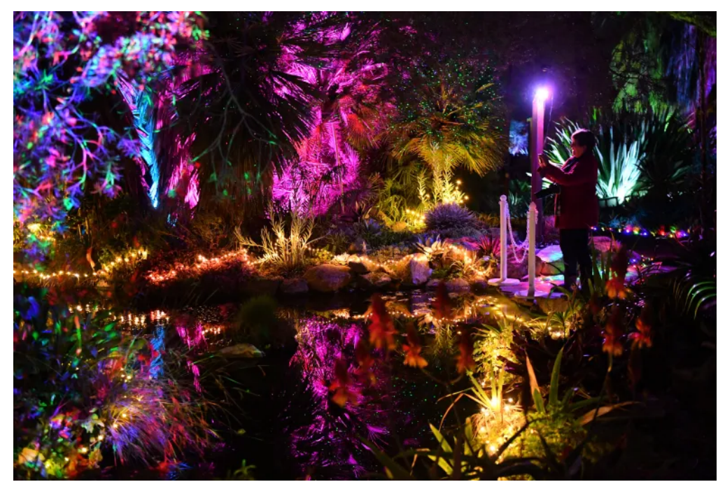
Thousands of holiday lights illuminate mature cacti, succulents and trees as visitors tour the 3.5 acre Ruth Bancroft Garden and Nursery on a cold evening in Walnut Creek, Calif..

Big Bad Voodoo Daddy Wild and Swingin' Holiday Party: 8 p.m. Nov. 25, 2400 First St., Livermore. Swing into the holiday season with this Grammy-nominated band that delivers high-energy jazz and swing music for over 30 years and promises to bring their signature sound to the stage with classic holiday tunes and original hits. $70-$100. bit.ly/BigBadVoodooDaddyHolidays