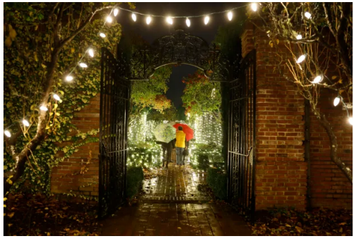
WOODSIDE, CALIFORNIA – NOVEMBER 17: Visitors walk in the Walled Garden at Filoli Historic House and Garden during their "Holidays Media Preview Night" in Woodside, Calif., on Tuesday, Nov. 17, 2020.

Great Dickens Christmas Fair & Victorian Holiday Party: Nov. 18-Dec. 17, The Cow Palace, 2600 Geneva Ave., Daly City. Enjoy an immersive holiday adventure with hundreds of literary and historical characters. Roam four acres filled with Victorian theaters, pubs and dance halls while enticing aromas of roasted chestnuts and hearty foods fill the air and dozens of lamplit shops overflow with handmade gifts. $0-$45. dickensfair.com/tickets/