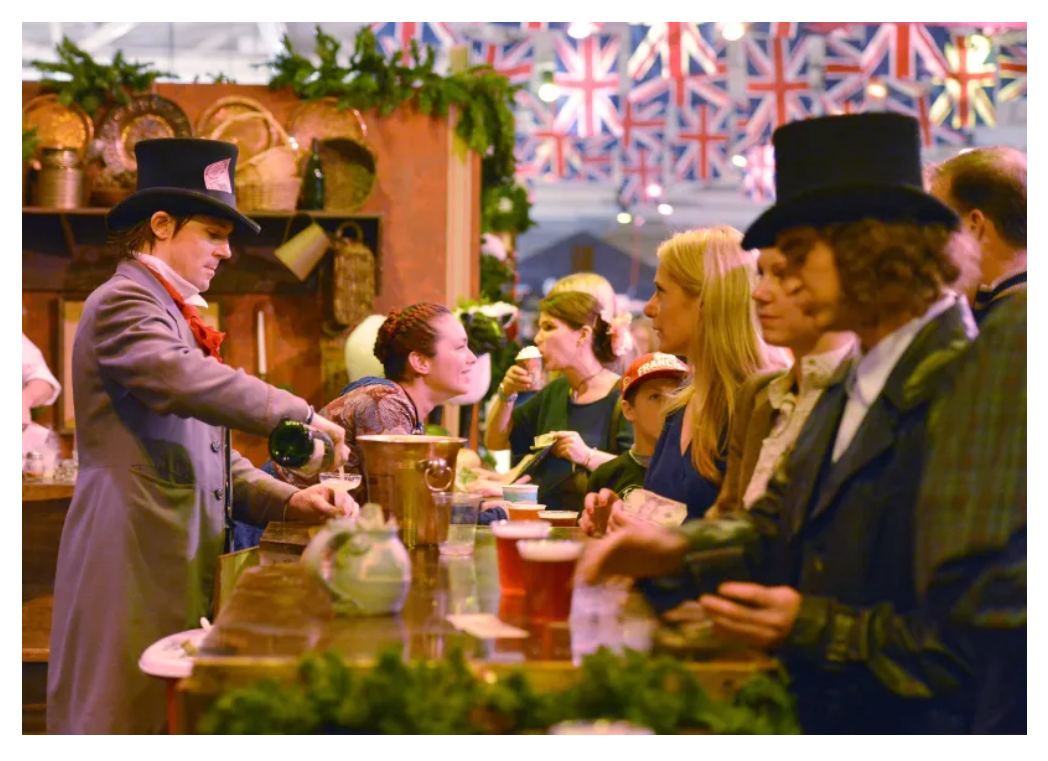
Four authentic English pubs and the Bohemian Absinthe Bar, serve up hearty Christmas cheer at the Great Dickens Christmas Fair & Victorian Holiday Party.

Here's a festive roundup of local ways to celebrate the holiday season.