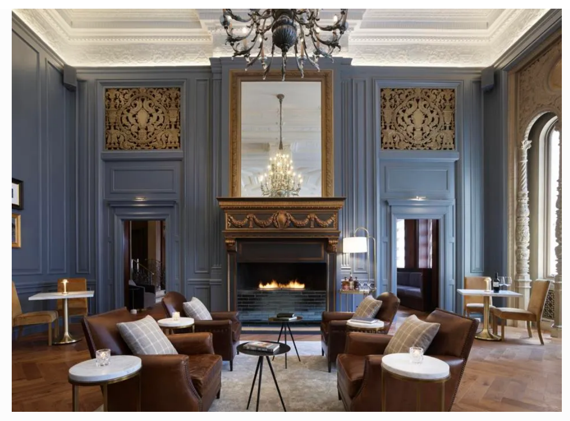
The Post Room BEACON GRANDE

The hotel also offers The Hidden Library, an cozy, hidden lounge with plush leather couches and walls filled with books, that offer special productions and vintages of bourbon, single malts, and ryes served neat. They are also offered in flights or as classic "threeingredient" cocktails. The Library showcases a collection of rare whiskeys serviced by a bartender-butler, alongside a barrel-aged spirits program using on-site casks.