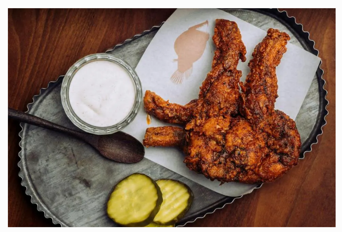
Angry Frog Legs with Cardamom Crème Fraîche

offered daily from 12PM - 2:30PM. Dubbed the Angler "Quick Catch," this is a 3-course pre-fixe of rotating dishes for an affordable $38. On the current menu are favorites like the Pacific Oysters with Seaweed Vinegar & Embered Tomato to start, Half Sea Bream with Coconut & Swarnadwipa or Half Roasted Chicken in the Wood Oven, and their signature Soft Serve Sundae for a decadent finish.