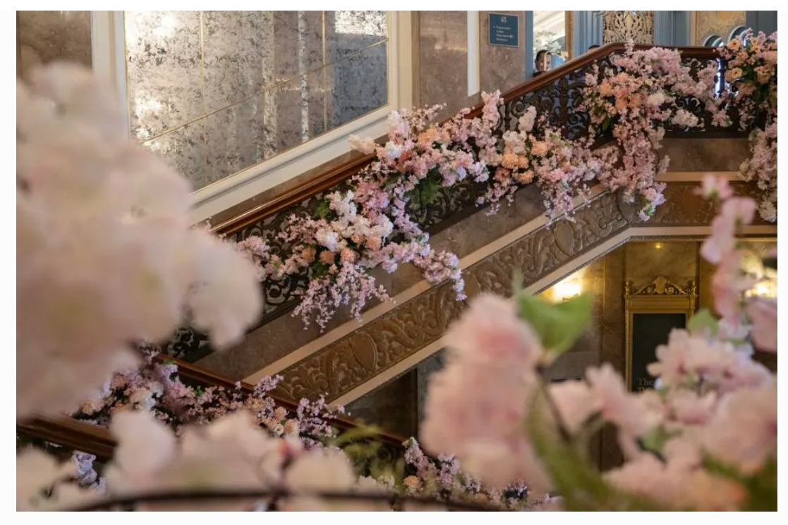
Beacon Grand SIDNEY TORRES

In addition to the Post Room's classic dining offerings, <u>Union</u> <u>Square in Bloom</u> is back, and Beacon Grand is celebrating with Blooms & Bubbles through July. The Post Room, is decked out in botanicals, from decorative displays to inspired bites and sparkling rosé pairings available now through July.