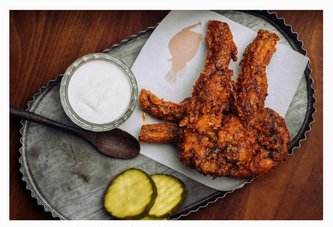
Angry Frog Legs with Cardamom Crème Fraîche

offered daily from 12PM - 2:30PM. Dubbed the Angler "Quick Catch," this is a 3-course pre-fixe of rotating dishes for an affordable $38. On the current menu are favorites like the Pacific Oysters with Seaweed Vinegar & Embered Tomato to start, Half Sea Bream with Coconut & Swarnadwipa or Half Roasted Chicken in the Wood Oven, and their signature Soft Serve Sundae for a decadent finish.