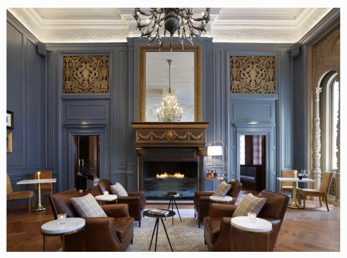
The Post Room BEACON GRANDE

Located at one of Downtown San Francisco's most iconic hotels is the newly opened The Post Room, a Mediterranean-inspired bar and lounge, overlooking the Beacon Grand's beautiful lobby. Situated in the heart of Union Square, the hotel's new restaurant features stunning high ceilings, European oak floors, floor-to-ceiling windows and ornate flourishes that elevate the ambiance of this classy new spot. The Post Room serves craft cocktails that include signatures like The Baron in the Trees, crafted with Luxardo Aperitivo Bianco, Amaro Pasubio, lemon-basil sour, and orange bitters; as well as a dedicated spritz menu and wine list featuring California vineyards.