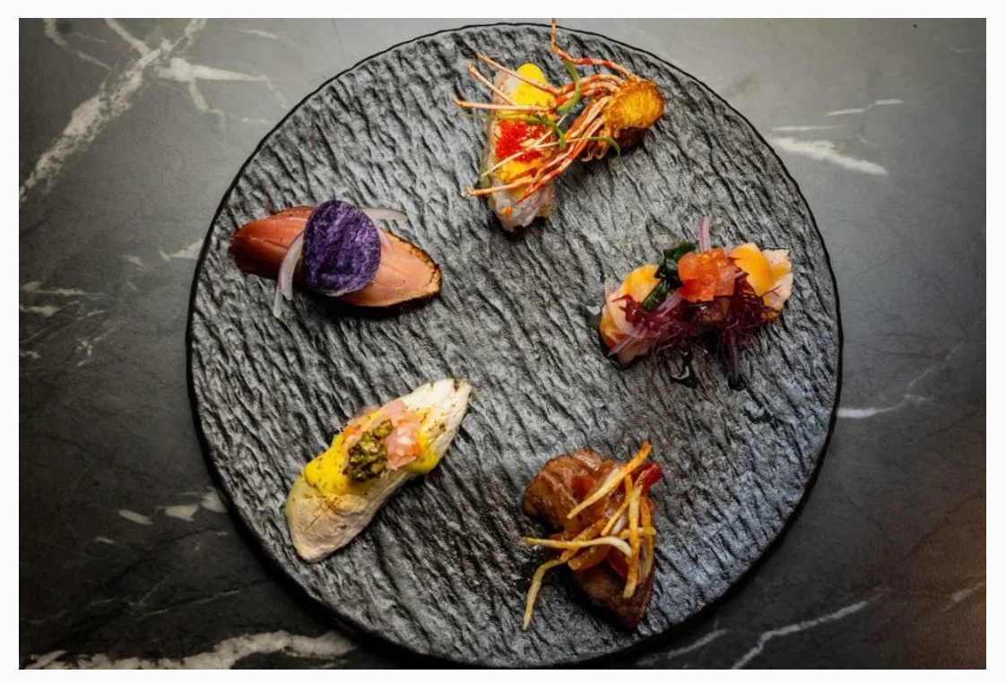
Nikkei sushi at KAIYŌ Restaurant & Bar ANTHONY PARKS

Unlike the other locations, KAIYŌ Restaurant & Bar features an intimate sushi counter by Chef Kenji Sawada offering an exciting new Nikkei sushi menu, featuring a la carte sashimi and nigiri options, specialty rolls, and three different preparations of nigiri sets: Nikkei with pieces like the lomo saltado and pisco cured pollo; Blue Fin with otoro, chutoro and akami; and "Toyosu," which features a rotation of fresh Japanese fish from Tokyo's new fish market, flown in weekly.