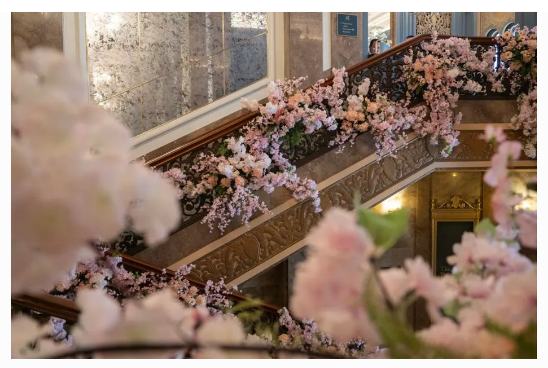
Beacon Grand SIDNEY TORRES

In addition to the Post Room's classic dining offerings, <u>Union</u> <u>Square in Bloom</u> is back, and Beacon Grand is celebrating with Blooms & Bubbles through July. The Post Room, is decked out in botanicals, from decorative displays to inspired bites and sparkling rosé pairings available now through July.