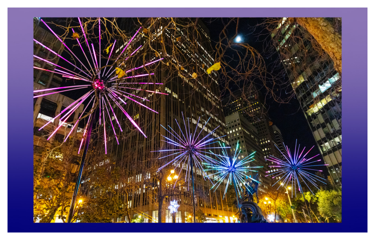
"Let's Glow SF"