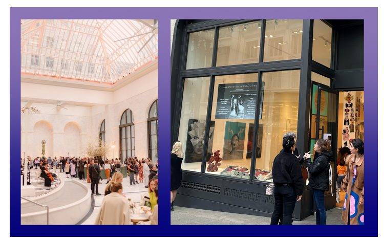
One Sansome's Conservatory (left) and the popup art gallery in Grosvenor's its Union Square property

ground-floor space on the same block as Burberry, Ferragamo and Harry Winston is one of several unoccupied spots Grosvenor has in the luxury shopping locale.