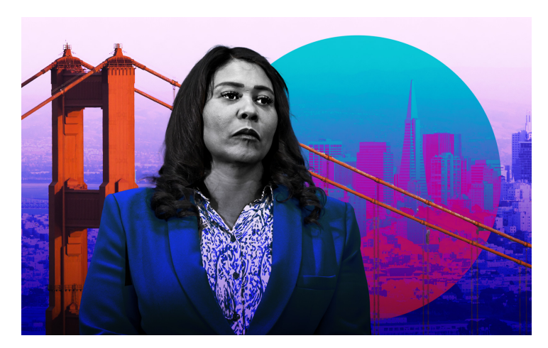
Mayor London Breed (Illustration by The Real Deal)

Commercial owners ready to "try stuff" as city strikes a more development-friendly pose