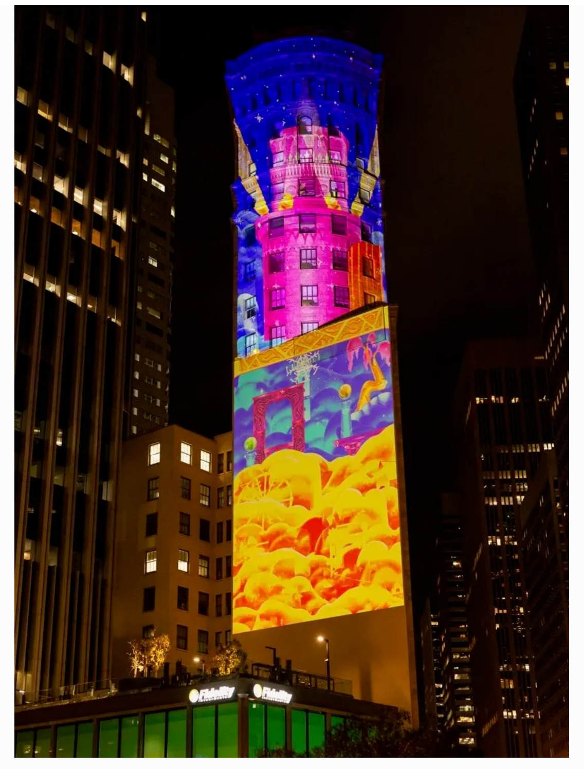
A downtown building tells a whole story in "True to Hue" by Indonesian projection artists The Fox, ... [+]

Forbes Daily: Get our best stories, exclusive reporting and essential analysis of the day's news in your inbox every weekday.