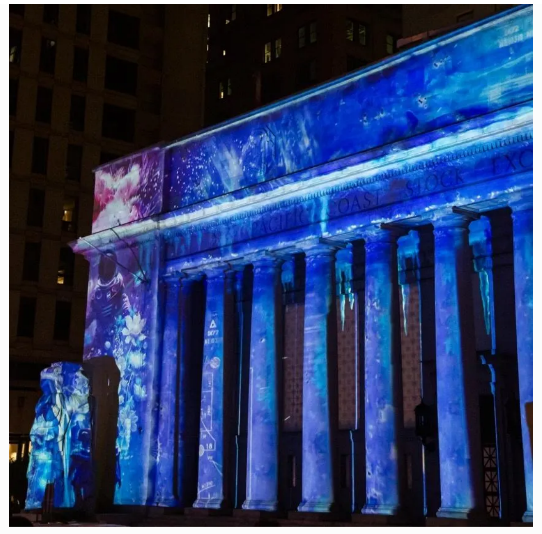
Light undulates across the Pacific Coast Stock Exchange in "Gloaming" by Italian creative agency ... [+] DOWNTOWN SF PARTNERSHIP

Iconic San Francisco buildings are aglow with festive light displays as part of a free holiday event that splashes kinetic artworks across downtown facades.