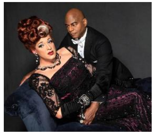
'The Confession of Lily Dare' @ New Conservatory Theatre Center