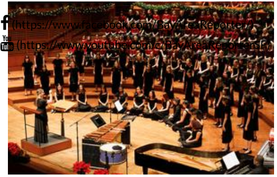
SF Girls Chorus @ Old First Concerts