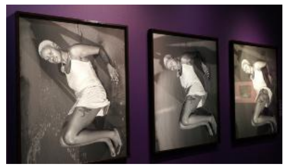
'Black Venus' @ Museum of the African Diaspora

Multiple galleries - Rena Bransten Gallery (Vik Muniz' 'Fotocubismo' thru June 24), Nancy Toomey Fine Art, Municipal Bonds, Eleanor Harwood Gallery, The Jones Institute and more- host different artist exhibits. 1275 Minnesota St. https://minnesotastreetproject.com/ (https://minnesotastreetproject.com/)