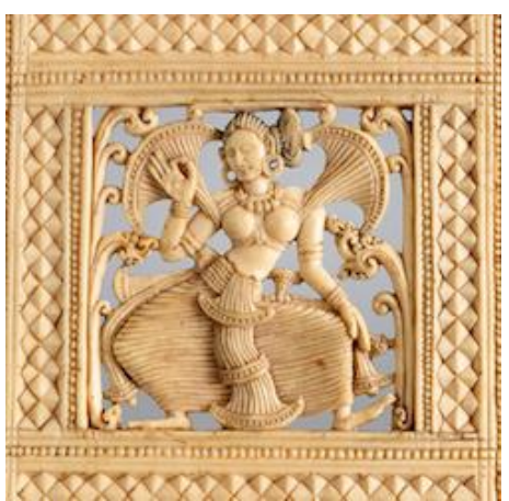
'Beyond Bollywood: 2000 Years of Dance in Art' @ Asian Art Museum

Exhibits of works by local artists. 1325 4th St., San Rafael. http://artworksdowntown.org/ (http://artworksdowntown.org/)