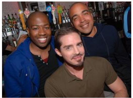
Pals @ Lookout