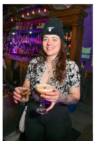
Mother Bar

Popular neighborhood bar known for its colorful aquarium and tasty drinks celebrates 40 years. 4049 18th St. https://www.facebook.com/MobyDickBar/ (https://www.facebook.com/MobyDickBar/)