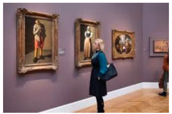
Legion of Honor

consider the planet's health. 1090 Point Lobos Ave. https://www.for-site.org (https://www.for-site.org)