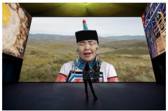
Mika Rottenberg's 'Spaghetti Blockchain' @ Contemporary Jewish Museum

Beautiful indoor and outdoor floral exhibits in the classic arboretum; special events and parties, too. 100 JFK Drive, Golden Gate Park. Free/$12. www.conservatoryofflowers.org (https://conservatoryofflowers.org/exhibits-events)