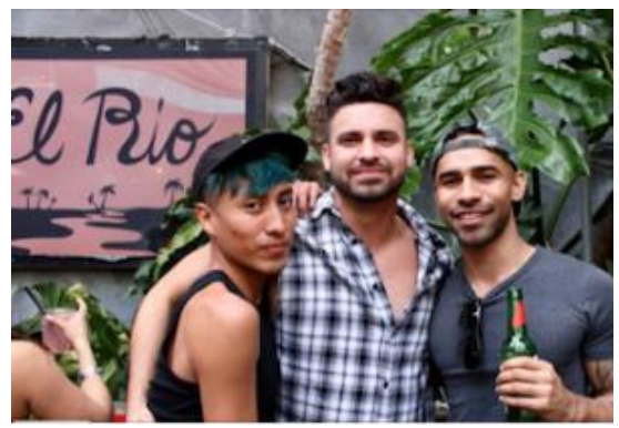
Hangin' out @ El Rio

The popular bar with a spacious outdoor patio hosts multiple LGBTQ events, including Hard French, Daytime Realness, Mango, live bands, comedy and more. May 20: Hot Sauce with Analog Soul. 3158 Mission St. https://www.elriosf.com/ (https://www.elriosf.com/)