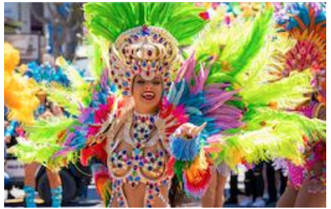
Carnaval San Francisco @ Mission District

Popular Castro nightclub with a dance floor and lounge areas, two bars, drag shows and gogo dancers on select nights; Picante Latin night on Thursdays. 2369 Market St. https://cafesf.com/ (https://cafesf.com/)