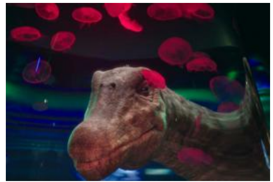
'The World's Largest Dinosaurs' @ California Academy of Sciences