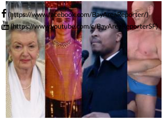
SF DocFest @ Roxie Theater