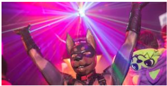
Frolic + Galactic Camp @ Folsom Foundry

New nightclub from the founders of Port Bar blends LGBTQ, straight and fluid patronage; Fri-Sun at 4pm-12am. 1544 Broadway. https://www.facebook.com/Fluid510/ (https://www.facebook.com/Fluid510/)