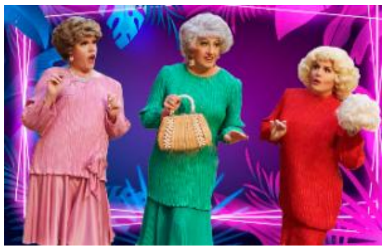
'Behind the Golden Curtain' @ Orinda Theatre

(Click here for listings of LGBTQ movies, TV series, podcasts and community organizations (https://www.ebar.com/story.php?ch=events&sc=arts_events&id=317111).)