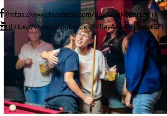
Pool-playin' pals @ the White Horse Bar