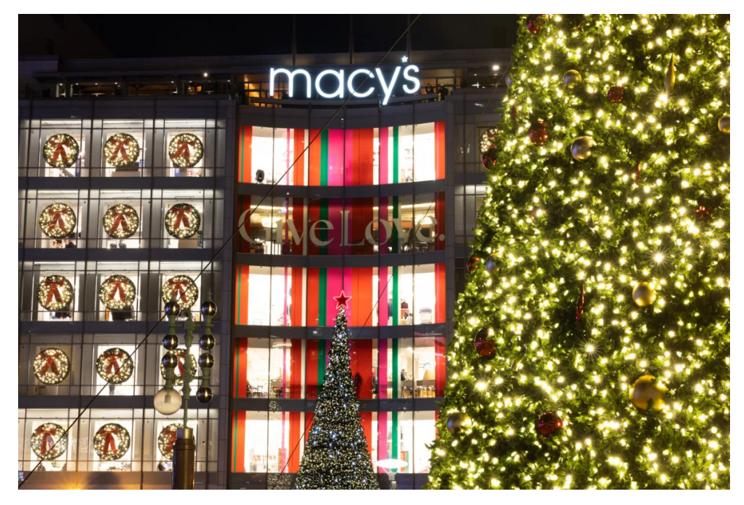
The Macy's Christmas tree at Union Square is illuminated for the 2023 holiday season.

Union Square is dressed up in its holiday best as Macy's Christmas tree at the center of the plaza stands 83 feet tall, bedecked with ornaments and a red star on top, through Jan. 1, but there is more to admire. From Dec. 7 to 15, the 25foot Bill Graham Menorah will glow over the scene, and the famous department store's windows showcase adorable