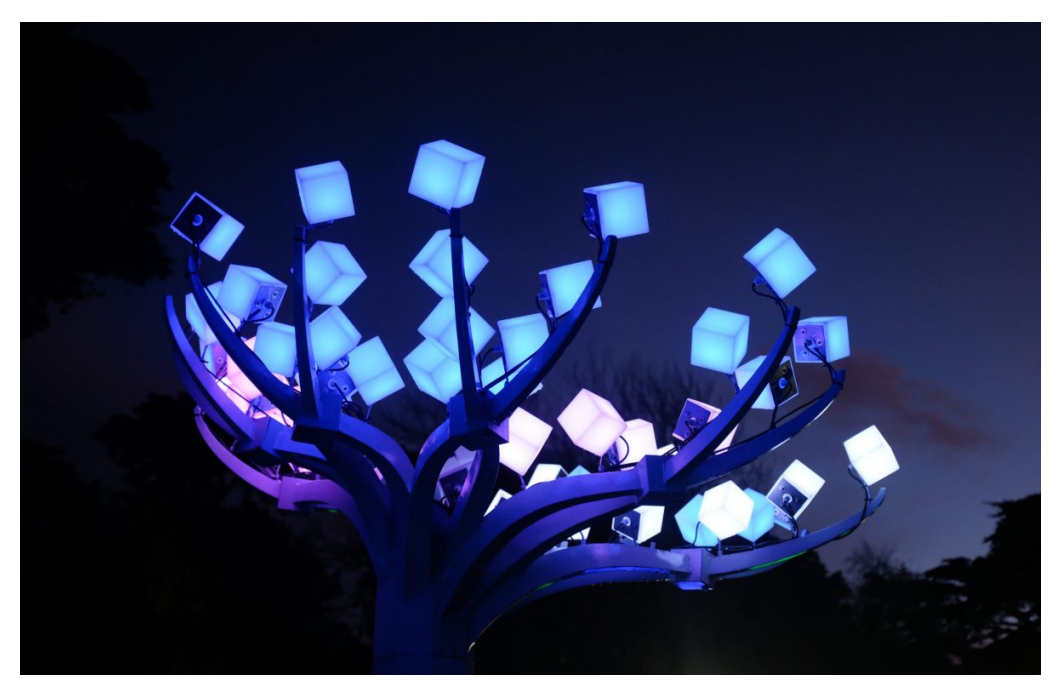
Light art installation "Entwined" returns to Golden Gate Park for the fourth time this month.

<u>The Winter staple Entwined returns</u> once again to Golden Gate Park's Peacock Meadow. The luminescent field of trees by Bay Area artist Charles Gadeken routinely transfixes audiences with its signature sugar cube-shaped foliage. This year, it's joined by a new addition called Elder Mother , a willowy, 30-foot-tall metal sculpture originally constructed