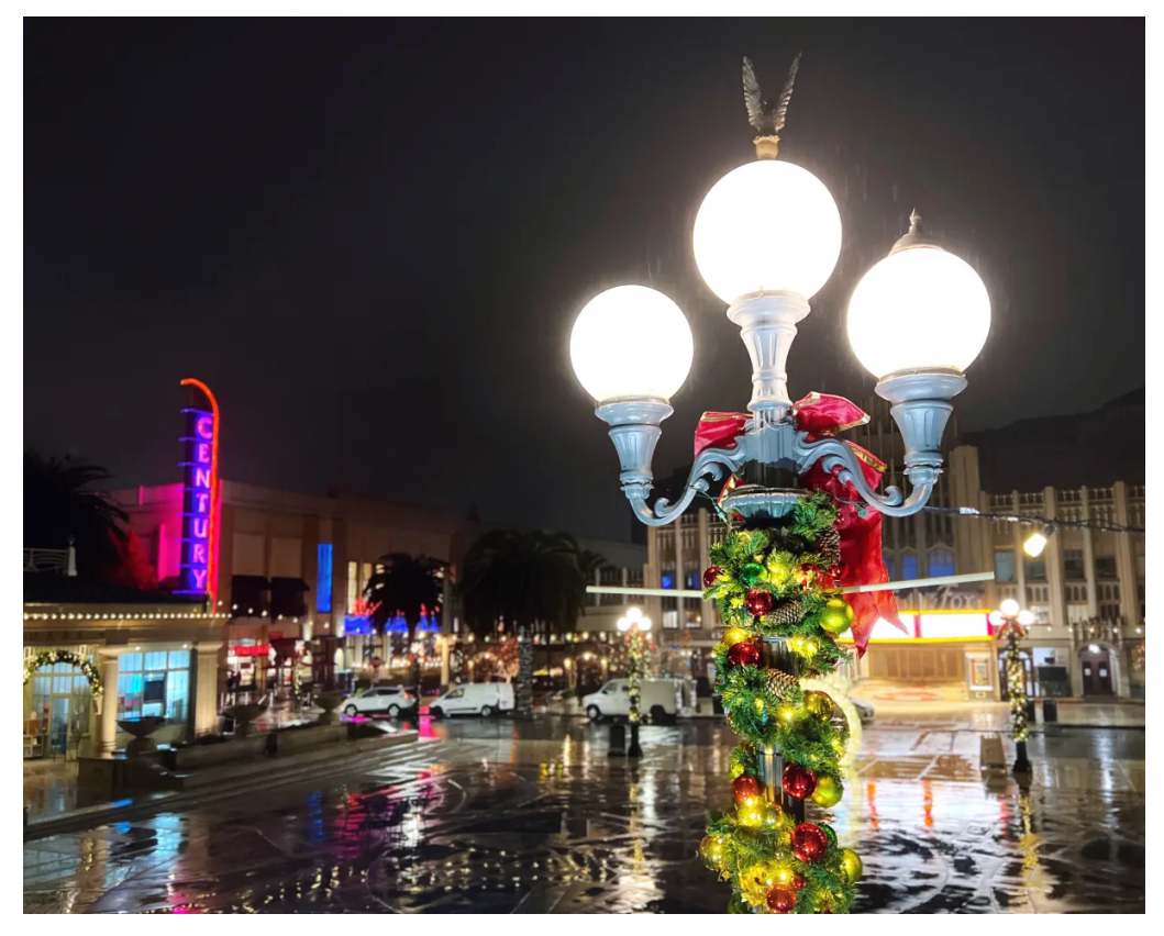
Redwood City's downtown gets dressed up with garlands and lights for the holidays.

Garlands, banners and lights decorate Redwood City's downtown throughout the holiday season. The community flips the switch on its tree on Saturday, and a menorah made from 27 painted canvases follows one week later. Periodically throughout the month, lucky visitors may hear a tune or two from the Merrie Olde Christmas Carolers, the world's oldest and largest professional caroling organization, who'll be spreading Christmas cheer in the streets. San Mateo's county seat showcases its holiday spirit with <u>a dazzling holiday</u> <u>parade</u> on Saturday, Dec. 2.