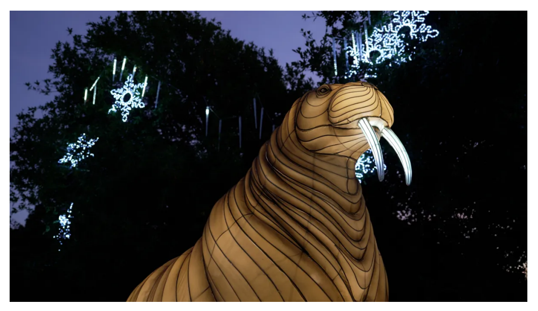
Oakland Zoo's Glowfari features giant animal lanterns, like this walrus.

Journey through this odyssey of light at the Oakland Zoo, where giant lanterns shaped like tigers, alligators and giraffes lanterns guide your way. The wildly popular experience doubles down on the winter theme with puffins and polar bears in its menagerie, although there are plenty of mountain lions, a larger-than-life octopus and even a field of flora and fauna inspired by Madagascar. Admission is free for kids under 2 and kids at heart over 76.