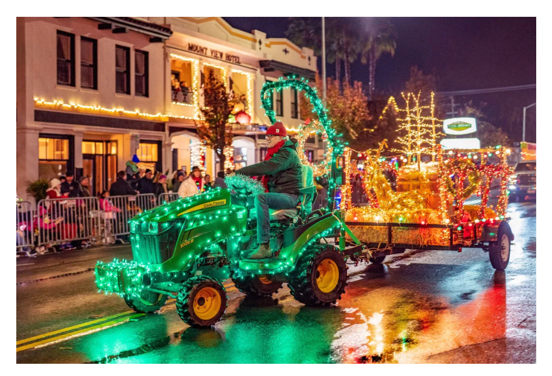
Calistoga's annual tractor parade pays homage to the Wine Country town's agricultural roots. Calistoga Chamber of Commerce & Visit Calistoga

This charming Napa Valley town dresses up for its annual tractor parade. From a John Deere tractor as green as the Grinch to a fire truck outfitted for Santa, see over 50 decorated haulers and floats as they cascade through the center of town in celebration of the holidays and the wine-soaked city's agricultural heritage.