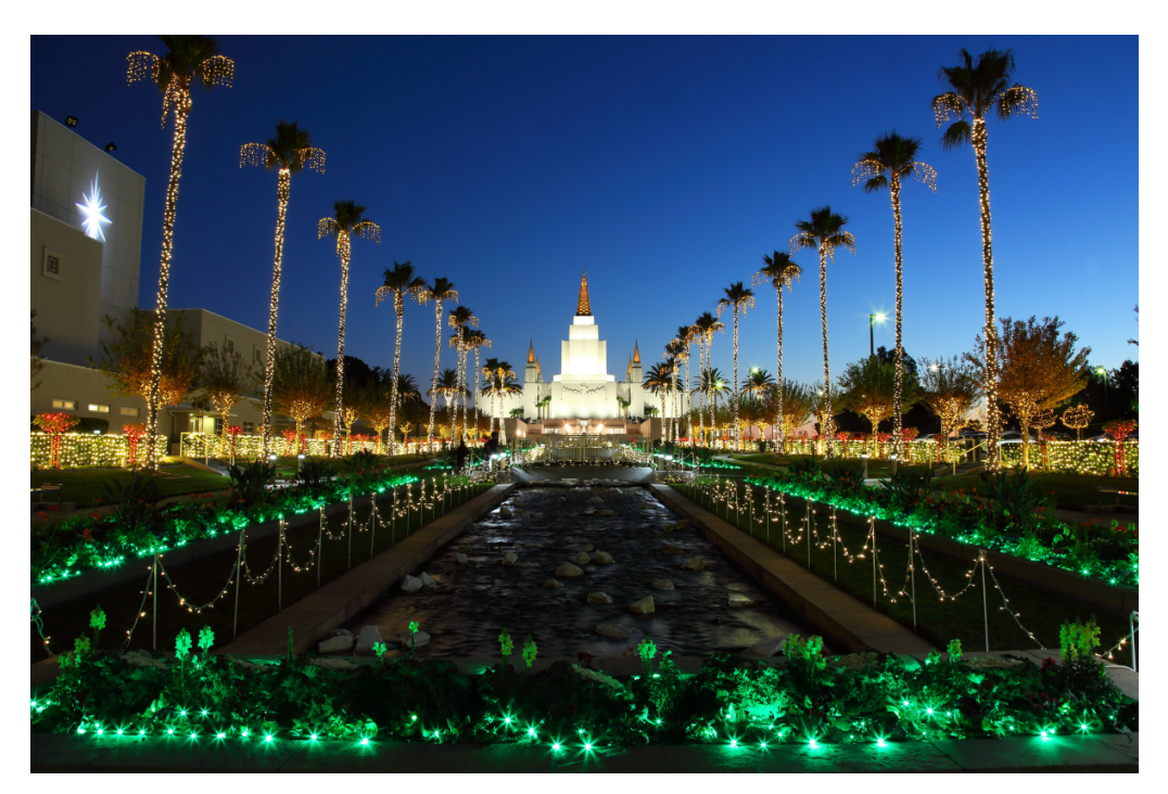
Oakland Temple Hill's grounds and palm trees are illuminated for the holidays.

More than 100,000 lights shimmer and bounce off the fountains and greenery of Oakland's palm-studded Art Deco Mormon Temple, halfway between the flats and the hills. With breathtaking views of the bay, its gardens are open to the public and illuminated from dusk until 9 p.m. nightly through the end of December. The church also hosts a series of performances, from choral concerts to the Nutcracker .