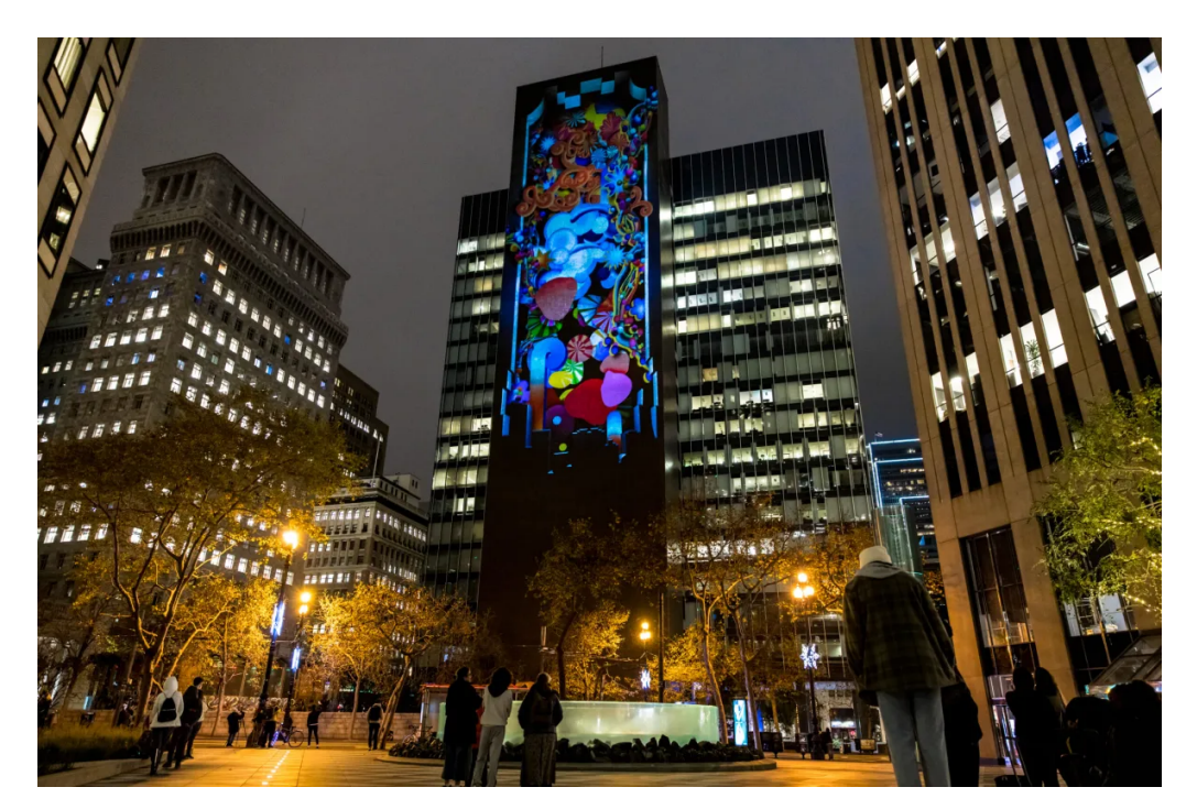
People look at projections outside of One Bush Plaza in San Francisco as part of Let's Glow SF.

Let's get the most technologically impressive display out of the way first. From Dec. 1 to 10, Downtown San Francisco's skyline will be illuminated with scintillating projections on city landmarks once again for the third annual <u>Let's Glow</u> <u>SF holiday light festival</u>.