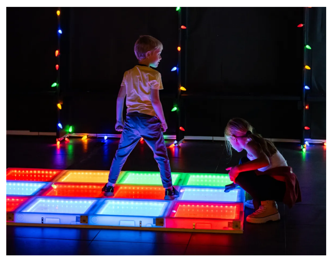
Northgate Mall's new indoor light experience features a rainbow LED dance floor.

If the chill of winter is making you yearn for the great indoors, head to this new indoor experience in San Rafael. More than 125,000 dazzling lights decorate seven rooms at Northgate Mall, where you can walk through corridors dripping with lights, tangles of tinsels and floating snowflakes. An interactive kids' zone features a brilliant LED dance floor and a wall you can scrawl on with glow-inthe-dark chalk. Admission for kids under 1 is free.