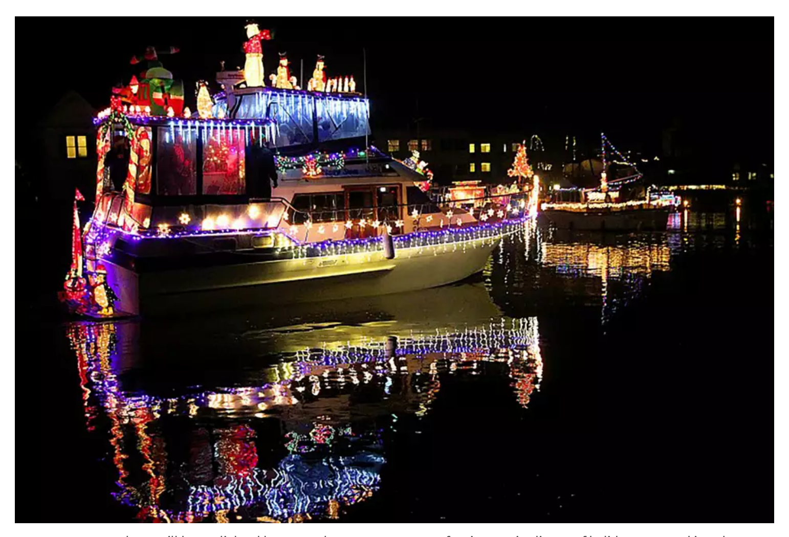
Downtown Petaluma will host a lighted boat parade on Dec. 9 as part of an impressive lineup of holiday events taking place in December.

5:30 p.m. Saturday, Dec. 9. Free, limited premium seats and after-party tickets available; reservations required. Gabrielson Park, Anchor St. and Humboldt Ave., Sausalito. www.winterfestsausalito.com