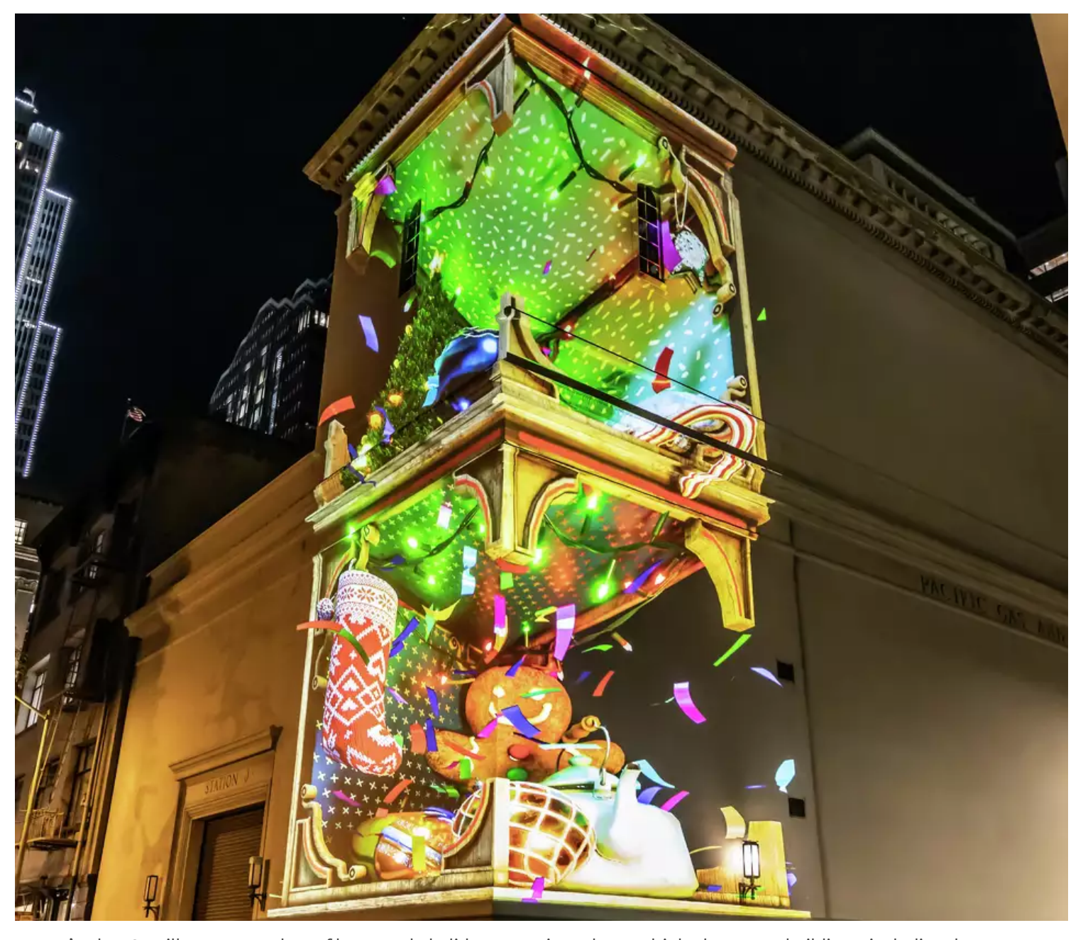
Let's Glow SF will present 10 days of large-scale holiday art projected on multiple downtown buildings, including the Landing at Leidesdorff.