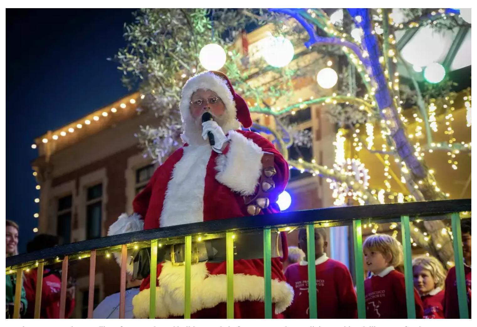
The S.F. Boys Chorus will perform carols and holiday music before Santa arrives to light up Ghirardelli Square for the holidays.