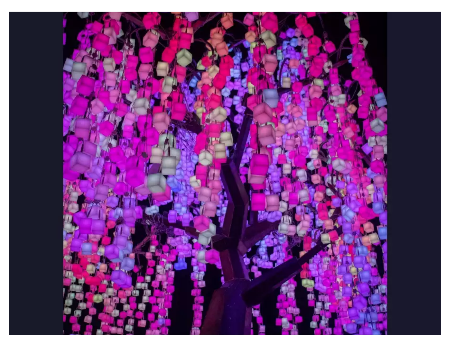
This year's "Entwined" nature inspired large scale light sculpture installation will include a new sculpture that was originally constructed for the Burning Man Festival, "Elder Mother" (pictured), has interactive elements and a grand 30-foot scale. San Francisco Rec and Park

4-7 p.m. Wednesday, Dec. 6. Free, <u>reservations recommended.</u> Civic Center Plaza, 355 McAllister St., S.F. 415-781-4700. https://sfciviccenter.org