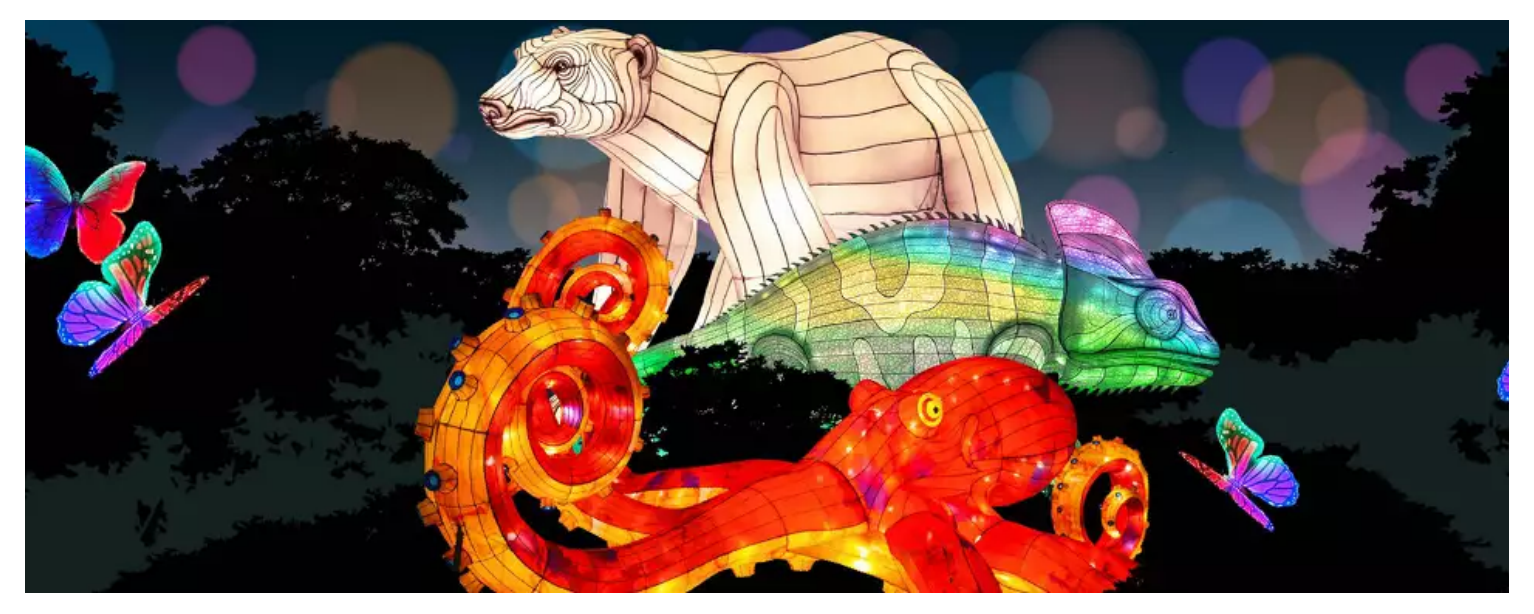
Stroll through the Oakland Zoo's "Glowfari" holiday lights installation. Oakland Zoo