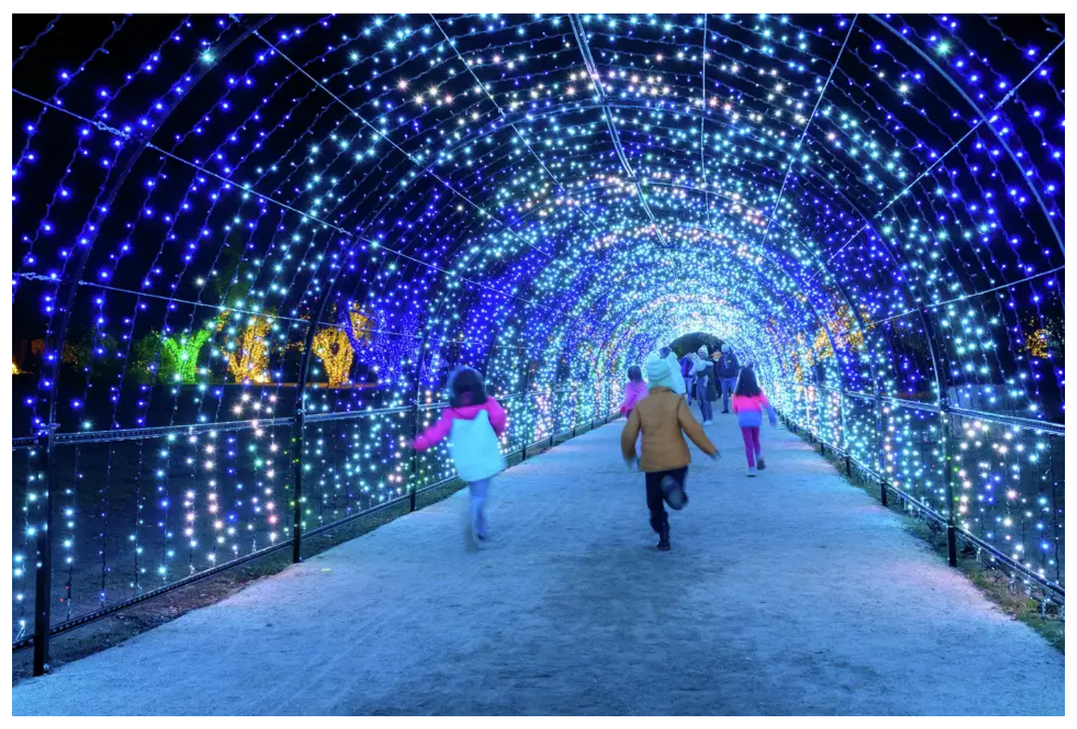
Holiday time at Filoli House and Garden offers extensive seasonal decorations including a tunnel of lights (pictured) and cozy fire pits.