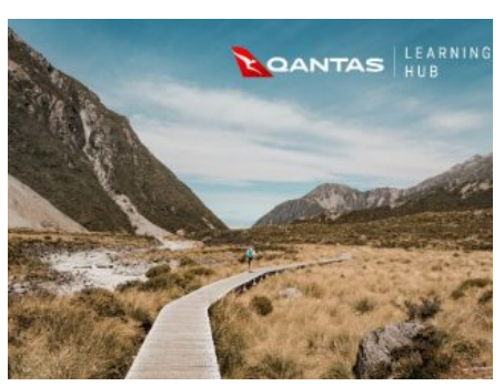
Travel Agents Invited To Win