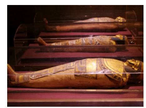
New Egypt E-Learning Programme...