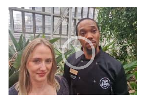
We talk South Carolina food -We talk South Carolina delicious