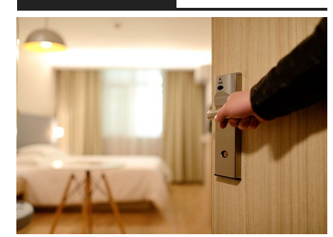
Police probe flight attendant's mysterious death