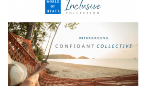
Introducing the all-new Inclus...