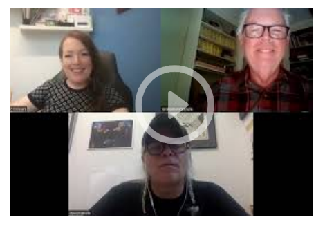
Celtic Colours Festival