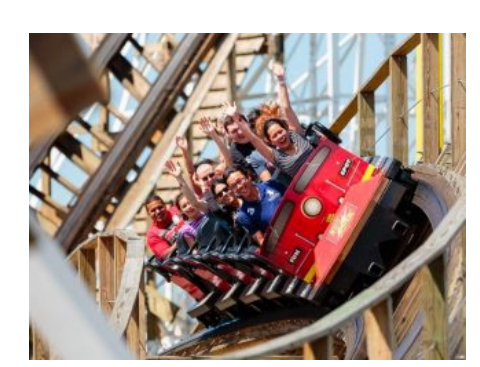
Welcome to the Orlando Travel ...