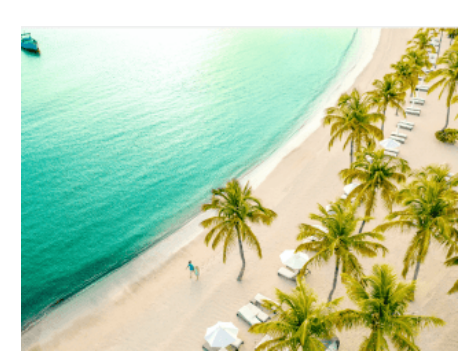
Earn while you learn with our ...