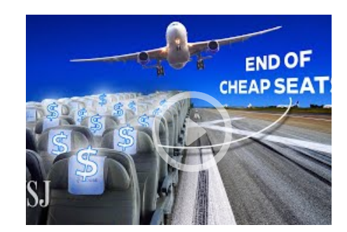
Airlines Are Offering Ultra-Cheap Transatlantic Flights, But How Long Can They Last? | WSJ