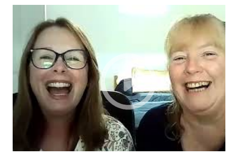
Did you watch Race Across the World? Meet the winners and meet Nova Scotia

RARE WORKS: Reuniting rare works from across the US and Europe, <u>Botticelli Drawings</u> —presented exclusively at the Fine Arts Museums of San Francisco's Legion of Honor from Novembe 19 to February 11 — is the first exhibition to explore the central role that drawing played in Botticelli's art and workshop practice. The exhibition unveils five newly attributed drawings alongside more than 60 works from 39 lending institutions. <u>Botticelli Drawings</u> features 27 drawings by the artist.